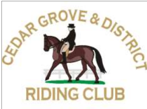
Our Club Logo