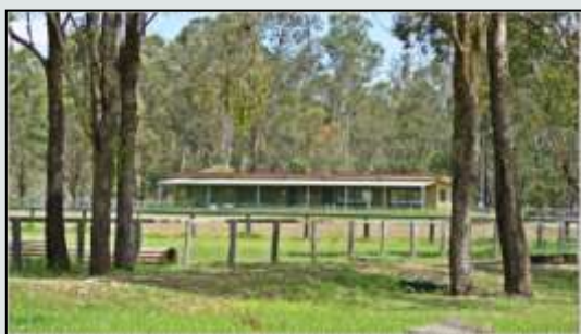
Our Club grounds 2010